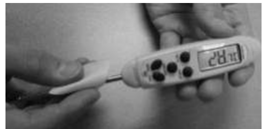
Cleaning a food thermometer with an alcohol wipe