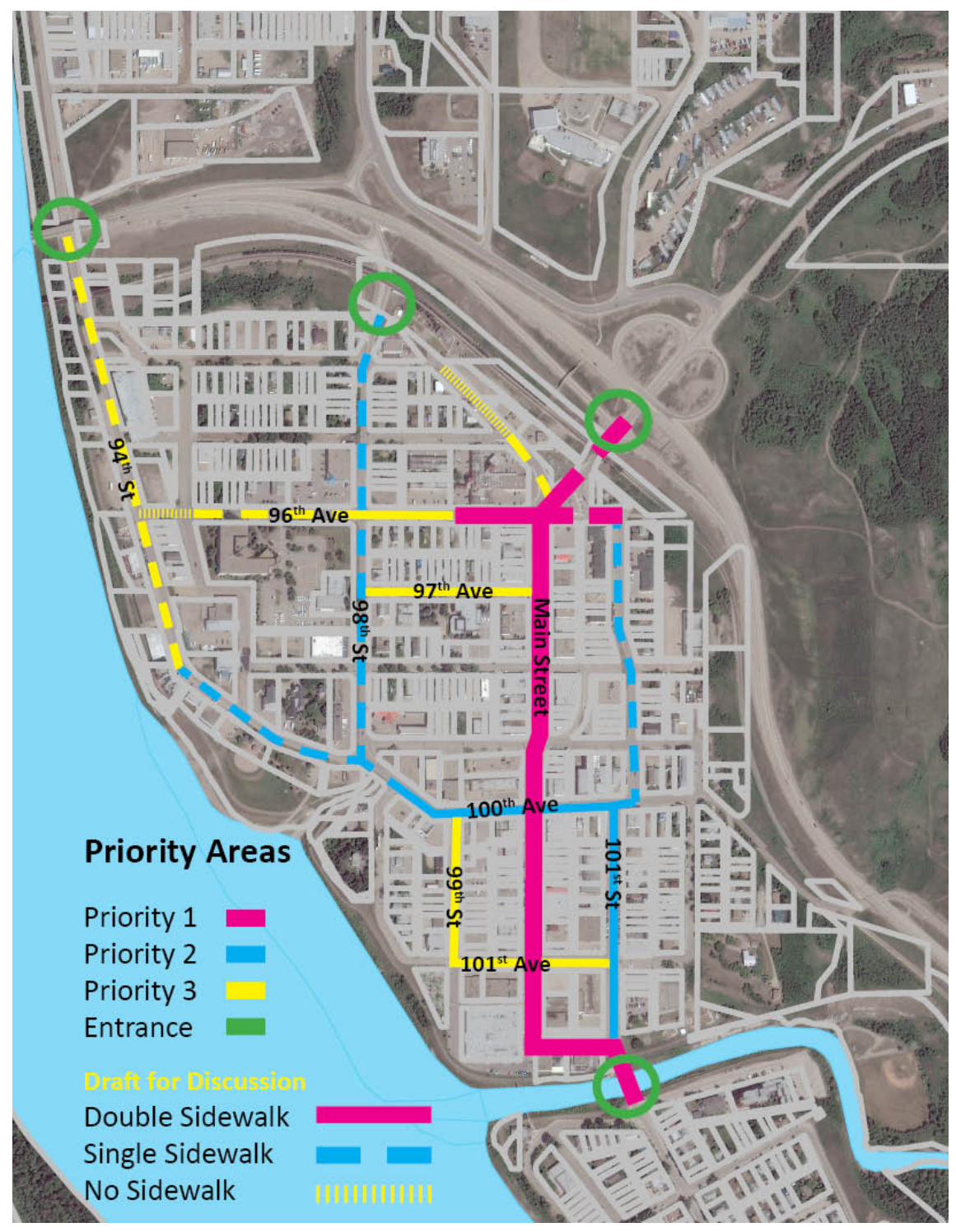
FIGURE 2 PRIORITY AREAS