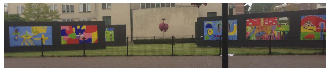
FIGURE 4 COMMUNITY ART WALL INSPIRATION

Installing an art fence along the edge of the property line and sidewalk at 9911 99 Ave (the 12' Davis Parking Lot) will clearly delineate the pedestrian area and prevent vehicle encroachment on the sidewalk. The fence would be made of dibond aluminum panels that serve as the canvas for the art. The Town will aim to work with local schools and children's programming to paint the canvases. The art is meant to be renewed on a regular basis (annually) depending on the community engagement with the project.