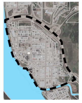
FIGURE 1 - PLAN AREA

For the purposes of this plan, the downtown is considered to be from 'bridge to bridge and river to highway', as outlined in Figure 1.