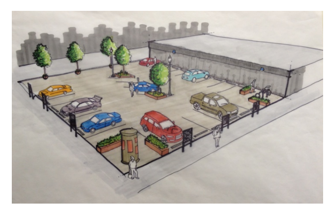
FIGURE 3 IMPERIAL PARKING LOT DESIGN

The lot at 10101 100 Street, across from the Scotia Bank, is a former gas station lot. As such, it is unlikely to be redeveloped in the near future. In 2014, an agreement between the Town and the landowner allowed the parcel to be used as a parking lot. A design concept was developed, to delineate the parking spaces and create a visual barrier between the parking and adjacent sidewalk. This plan would see the final components of the design concept, namely trees, bike parking and decorative solar light standards, purchased and installed.